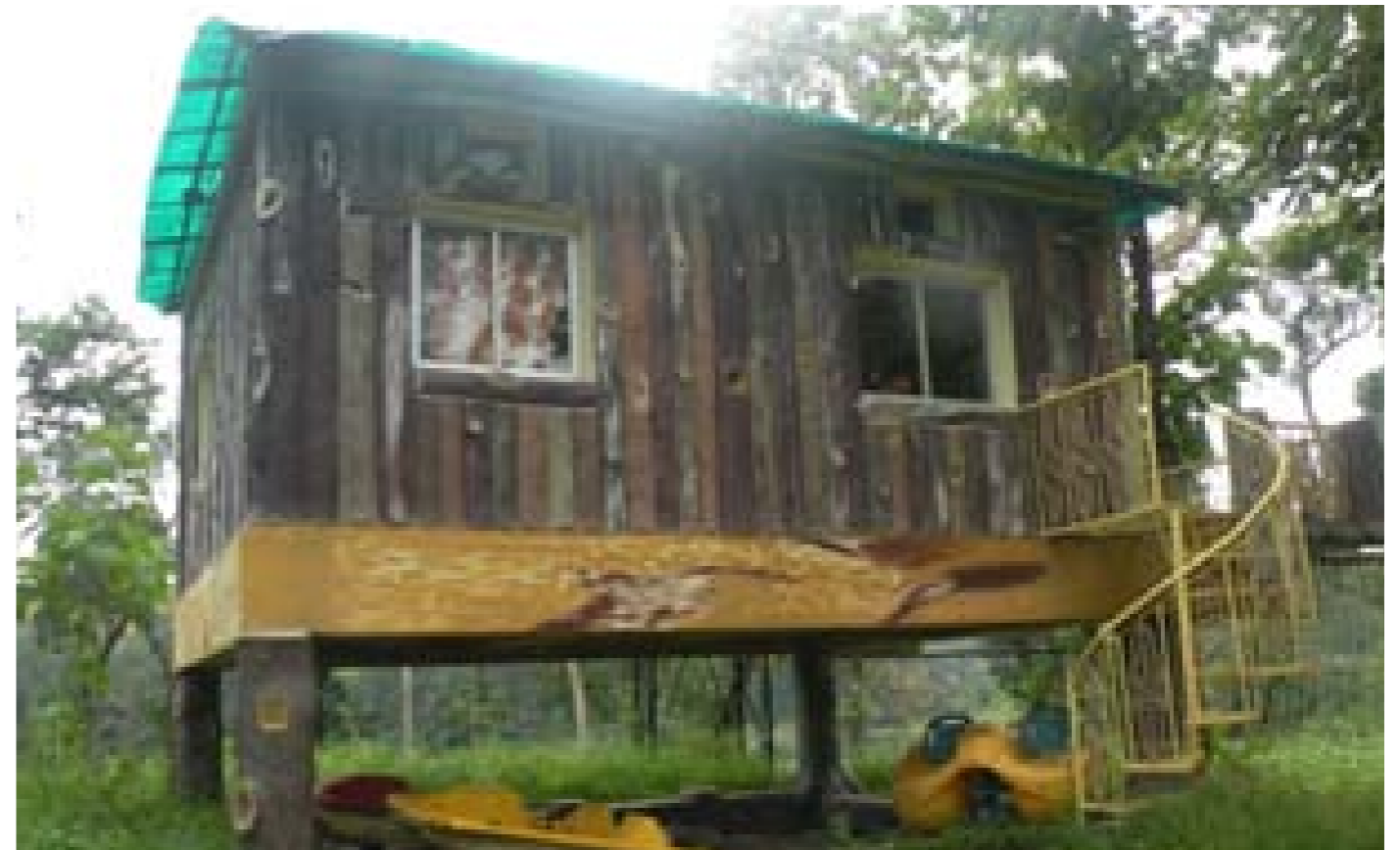
THE FOREST TREE HOUSE AND THE LAKE VIEW FROM THE ROOM

Sakata is yet another amazing destination situated in the Pench buffer zone. Situated in the middle of the forest, with no disturbances from the outside world, you can relax in the rest house which was built over a century ago. Sakata is a very small tribal forest village with around 15 households where one can interact with the villagers and learn about the local tribal culture. MPEDP has opened various camping and other recreational activities at this site as well.