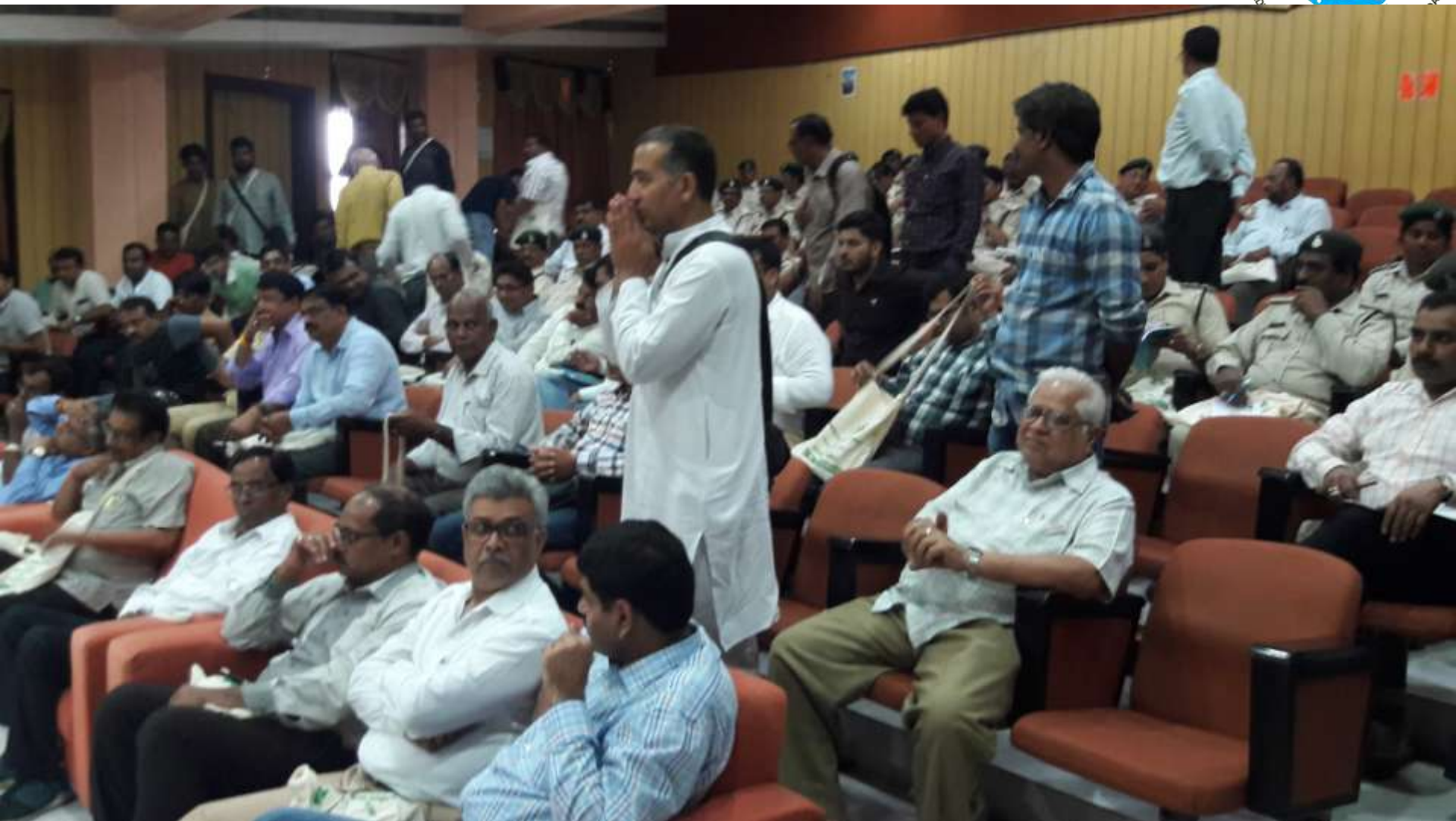
Meeting with Traders